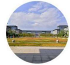
Government Office Building